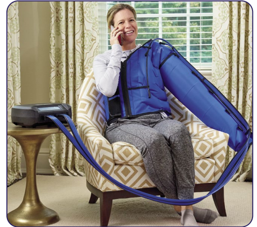
Upper Extremity/8 Chamber Garment Sizing Chart